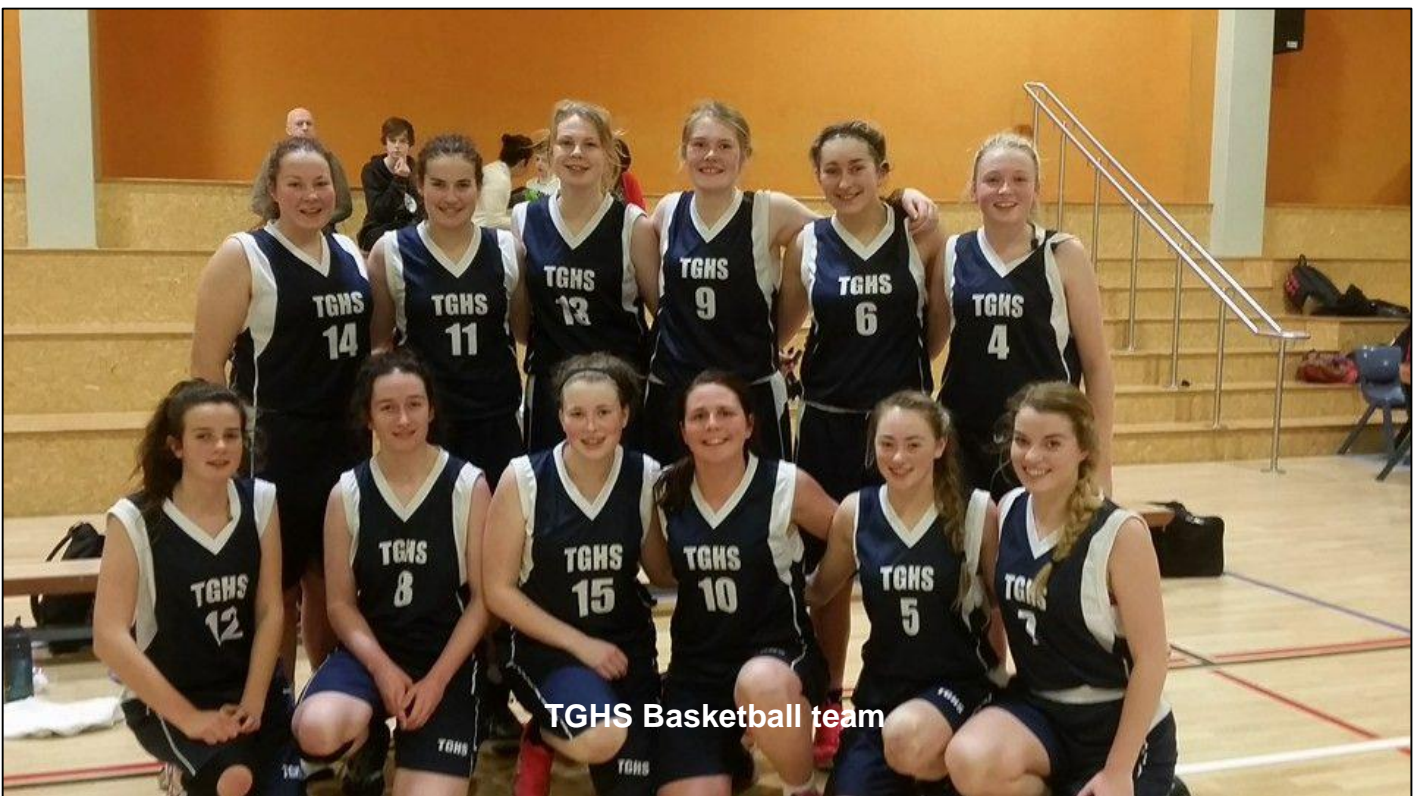
TGHS Basketball team