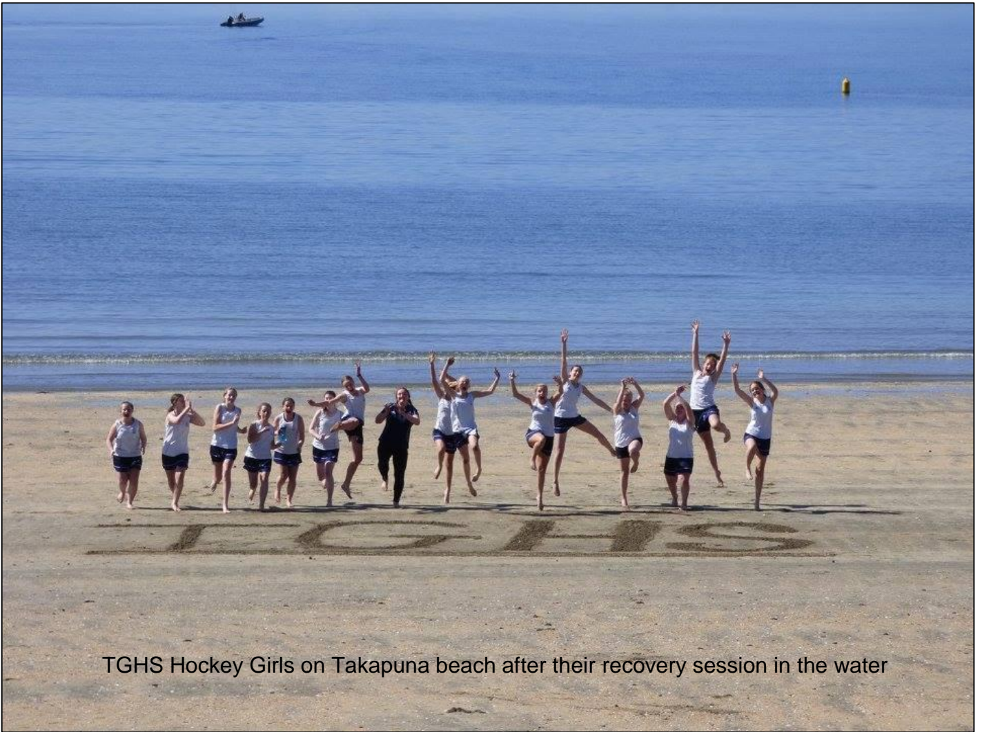
TGHS Hockey Girls on Takapuna beach after their recovery session in the water