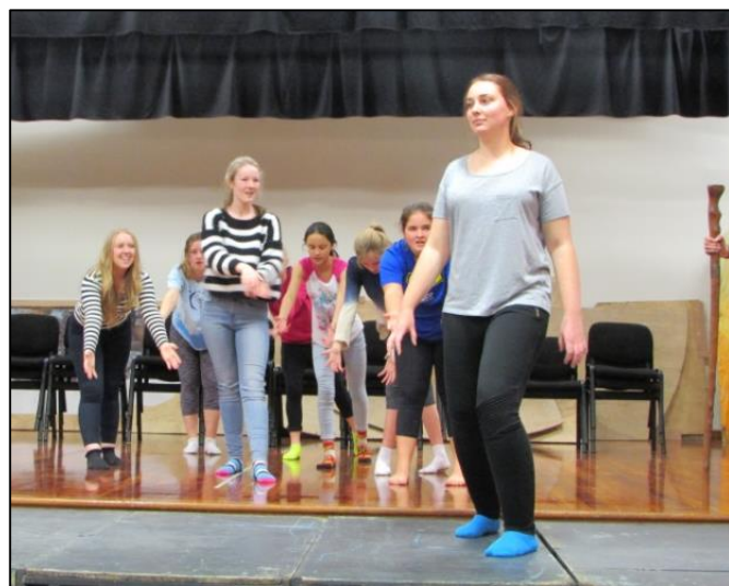
Above: Our girls rehearsing for the TBHS/TGHS combined production due to perform later this month – see back page

Great things are happening in the hostel, watch this space. – Michaela Watt, Head Boarder 2016