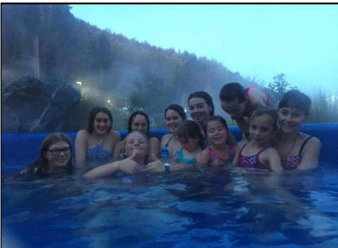
Above: In the hot pools at Tekapo