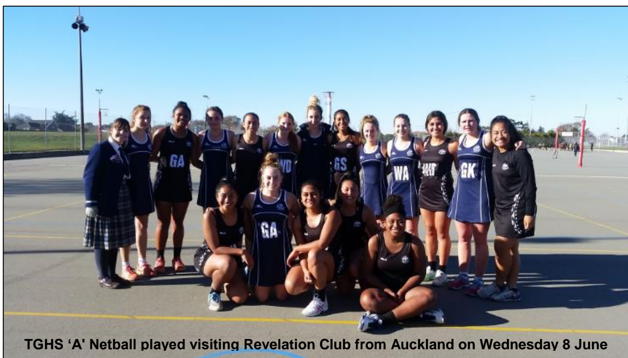
TGHS 'A' Netball played visiting Revelation Club from Auckland on Wednesday 8 June