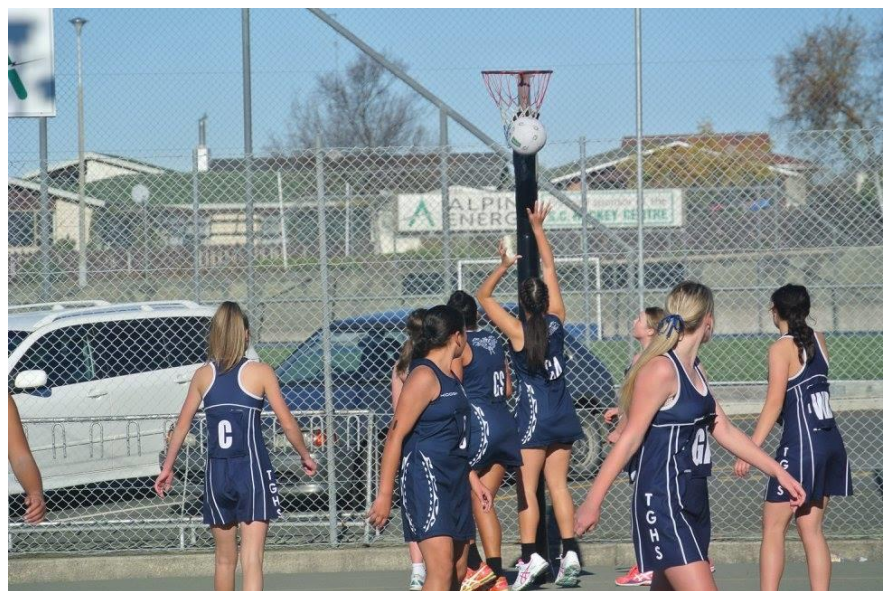
Top right: Netball Exchange with Mangere Auckland